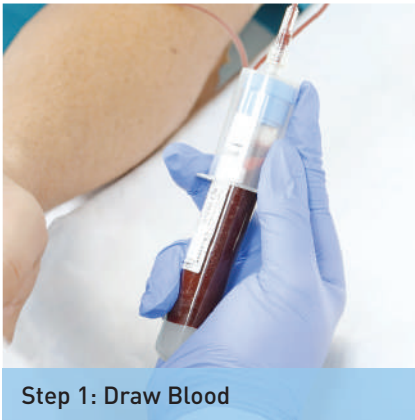
Step 1: Draw Blood