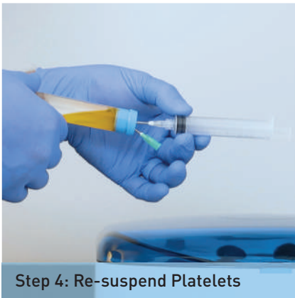
Step 4: Re-suspend Platelets