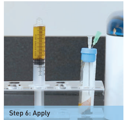
Step 6: Apply