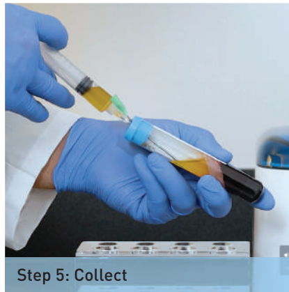
Step 5: Collect