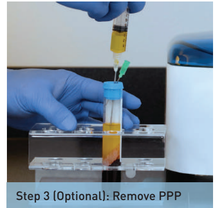
Step 3 (Optional): Remove PPP